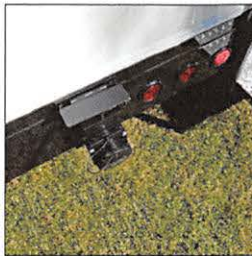
The rear bumper center-mounted dump valve provides ease of service, or use the above-tank evacuation in the service compartment.

Trailer Height (w/AC): 121" Trailer Length: 183" Trailer Width: 96" Restroom Int. Width: 48.5" Restroom Int. Length: 41.5" Restroom Int. Height: 80.5" Door Opening: 72x24" Dry Weight: 2520 lbs. Loaded Weight: 3600 lbs. Axle Rating: 6000 lbs. Fresh Tank Capacity: 90 gal. Waste Tank Capacity: 150 gal. Service Access Doors: 1 Average Number of Uses: 280