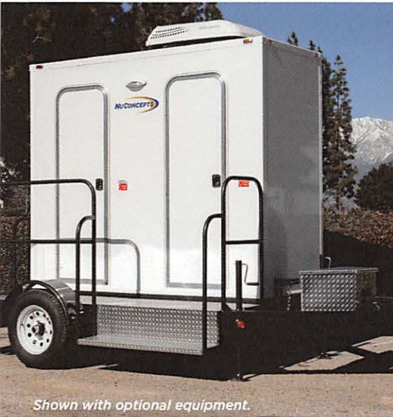
Shown with optional equipment.